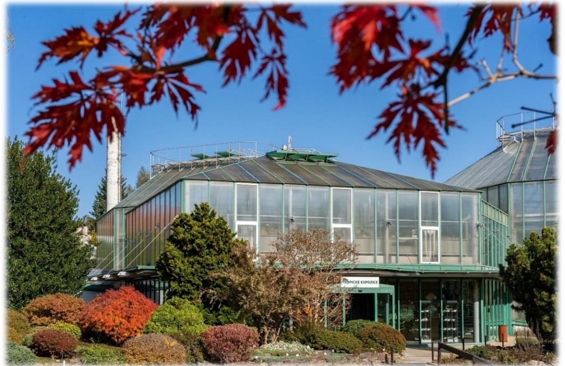
photo: entrance to the tropical greenhouses

ORIENTAL GARDEN – From spring to autumn, the exhibition offers a glimpse of the rare bonsai - Juniperus chinensis 'Echiniformis'.