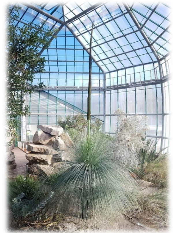
foto: Xanthorrhoea glauca